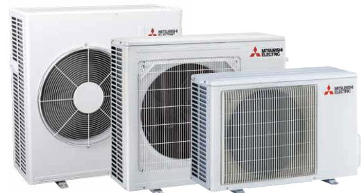
MSZ-AP71/80VG(D*) MSZ-AP50/60VG(D*) MSZ-AP25/35/42VG(D*)

(D*) represents DRED enabled model. This is only available in QLD. Multi-split system compatibility with model numbers MXZ-*E**VAD2-A1 only.